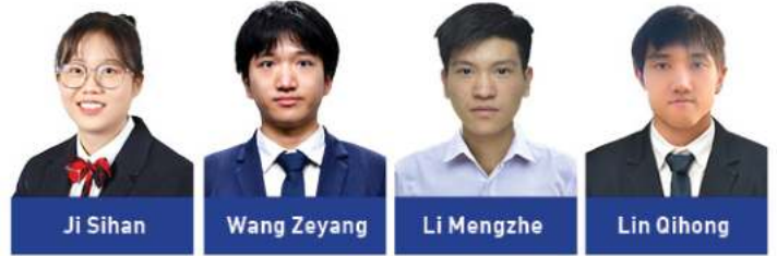
Imperial College London (2025 QS World Ranking #2)

FIS has a proud history of producing academically excellent graduates who have gone on to further their studies at QS top 20 universities such as Cambridge University, Oxford University, University College London, National University of Singapore, Nanyang Technological University, Imperial College London and University of Edinburgh.