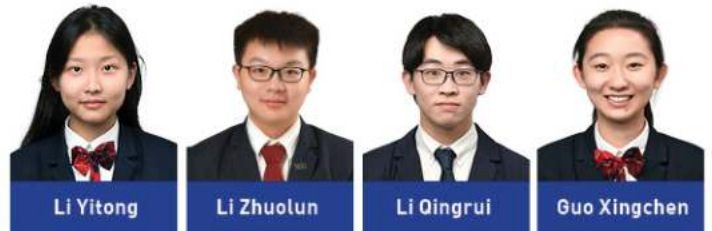
National University of Singapore (2025 QS World Ranking #8)