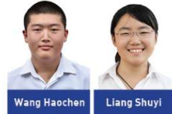
University of Oxford (2025 QS World Ranking #3)