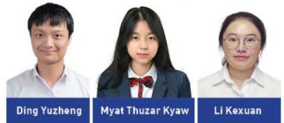
University of Cambridge (2025 QS World Ranking #5)